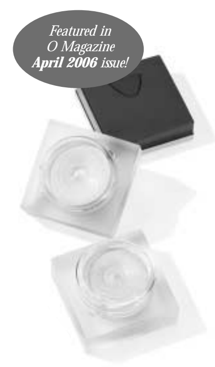
6022 - BU 01 Shooting Star 6023 - GD 01 Moonlit Gold